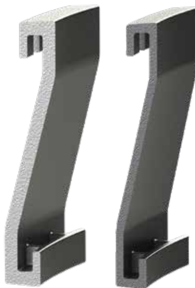
25 mm segment

To prevent mechanical wear caused by quartz particles or other hard and erosive particles, the 25mm segment can be used to upgrade the entire cast central pipe or only parts of it.