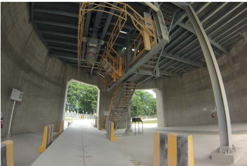
Figure 2. Ventomatic® bulk loader, with movable safety barriers and weighbridge.

Here, a revolutionary concept has been introduced to the market: a POLIMAT palletiser feeds bag stacks to the Ventomatic® Flying Fork-Lift FFL, which automatically loads them directly onto trucks without pallets (Figure 4). This greatly simplifies the logistics,