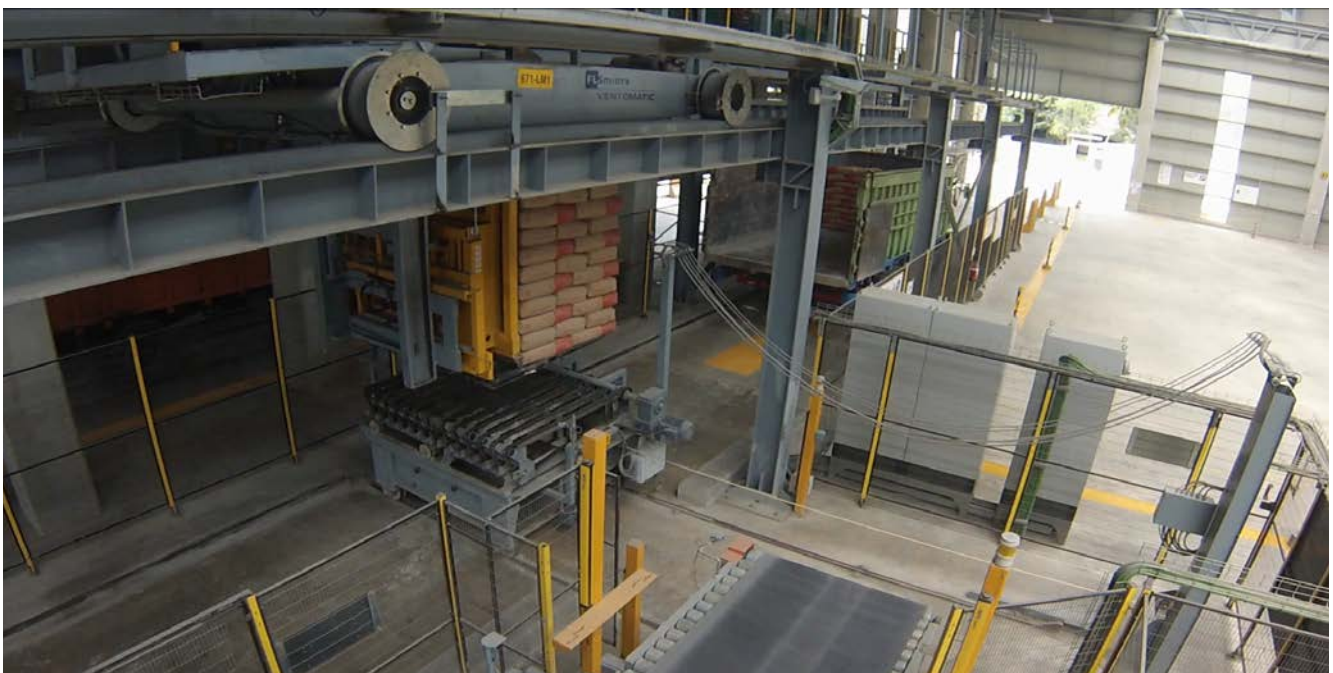
Figure 3. Ventomatic® Flying Fork-Lift FFL automatic truck loader for stacks of bags.