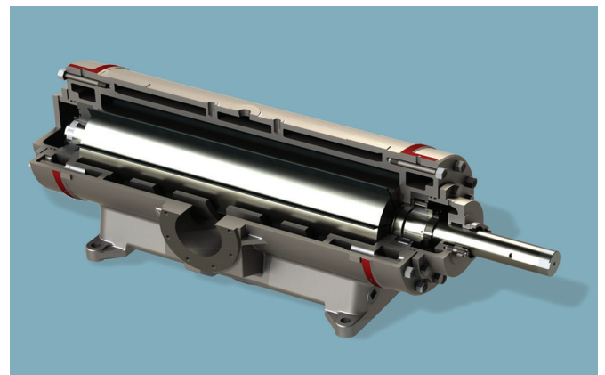
Ful-Vane™ Air Compressor cutaway showing rotor with B3000™ blades